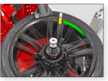
The bead rollers safely hold the tire stationary while the rim is rotated to complete match-mounting.